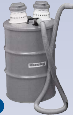
B Industrial Vacuum - 2 x 2.5HP