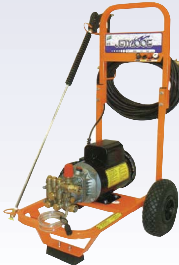
E Pressure Washer