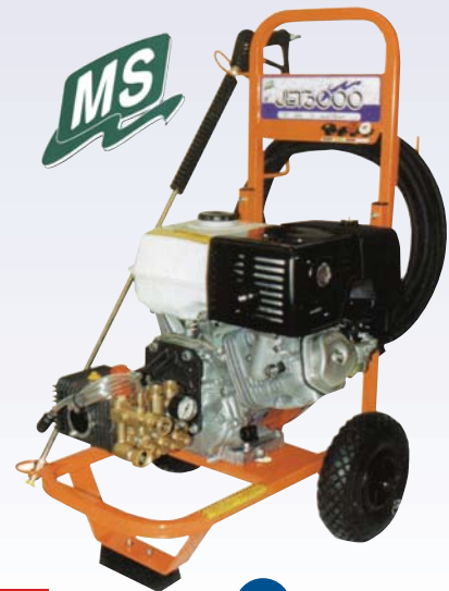
F Pressure Washer