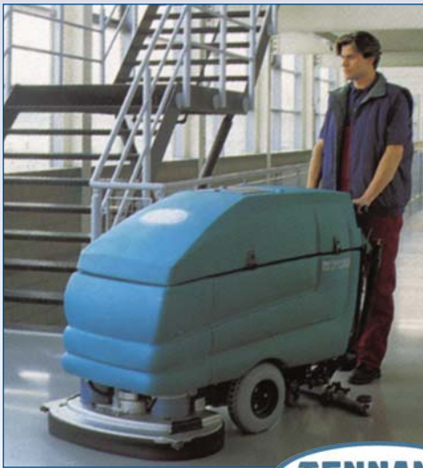
D Floor Scrubber