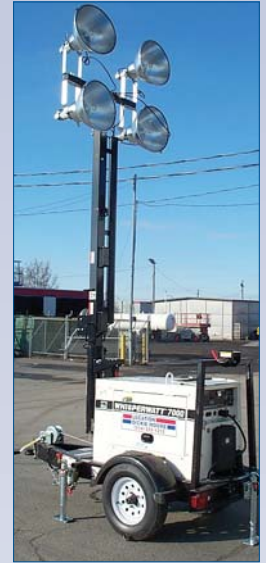
D Tower Light