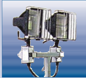
Floodlight - Portable - 2X500W