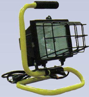
A Floodlight - Portable - 500W