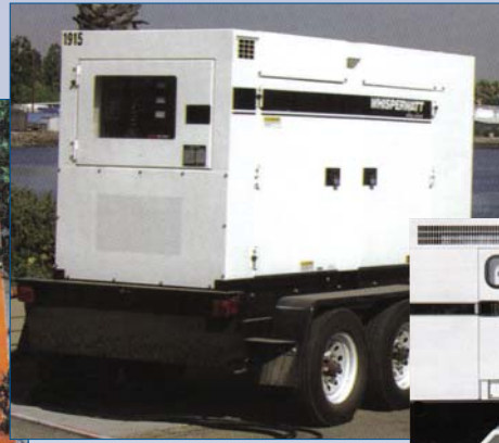
B Generator - 35KW