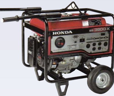
B Generator - 3800W