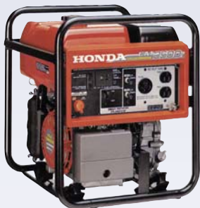
A Generator - 2500W