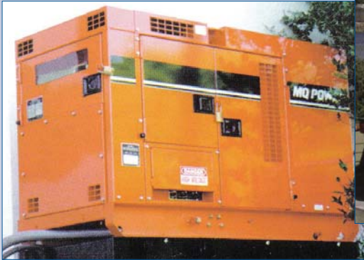
A Generator - 12KW