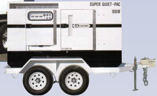
C Generator - 105KW