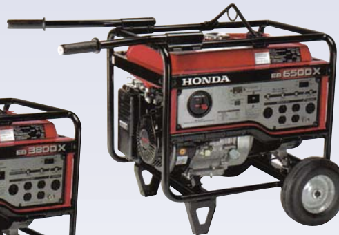
C Generator - 6500W