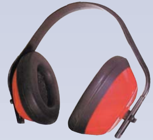
H Ear Muffs