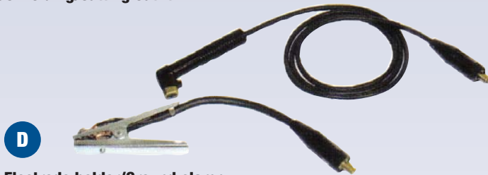
D Electrode holder/Ground clamp