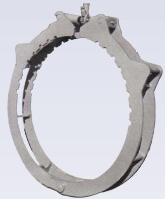
G Line-up clamp